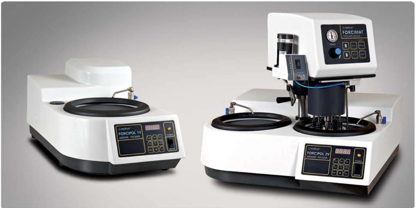
FORCIPOL 1V ( above left ), FORCIPOL 2V with FORCIMAT ( above right ).

FORCIMAT is a microprocessor controlled sample mover designed to be used with FORCIPOL grinder / polishers. It is ideal for medium size labs where consistent result are desired.