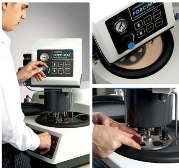
By using the FORCIMAT automatic head, the efficiency increases and same consistent sample quality is guaranteed.

An adjustable and exchangeable drip lubricator is optional and the dosing level is done through an adjustable flow valve. The Forcimat Automatic Head offers variable speed with reversible (clockwise or counter-clockwise) rotation. A choice of easily exchangeable sample holders with set of rings from 25 to 50 mm and 1" to 2" diameter are available for use on the FORCIMAT. The samples (1 to 6) are placed in the sample holder and the dosing level of the drip lubricator is adjusted. Sample force is set on the front panel of the FORCIMAT. Cycle time, wheel speed and direction are set on the control panel of the FORCIPOL grinder/polisher. When the start button is depressed, both the FORCIMAT and FORCIPOL start operating simultaneously. Upon completion of the cycle, both instrument stop and an audio signal notifies the operator.