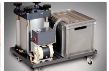
Enviro recirculating filtering unit (1 micron)