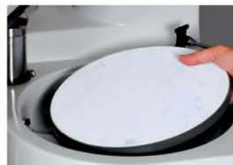
Simple exchange of working discs