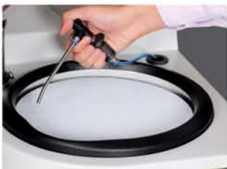
Retractable water hose for easy cleaning

When the number of specimens to be prepared increases, FORCIPOL instruments can be fitted with FORCIMAT automatic head for automation. FORCIMAT automatic head provides high rate sample preparation and frees the operator from the grinding and polishing procedures.