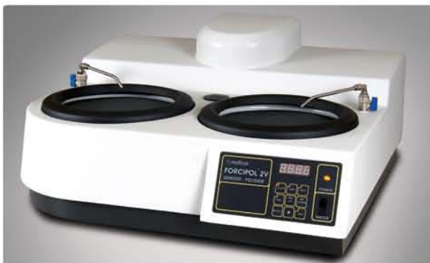
FORCIPOL 2V, Variable speed unit with two discs.