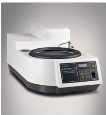
FORCIPOL 1V variable speed grinder / polisher

All materials testing laboratories in the industrial, research or educational field have a demand for sample preparation. Whether your requirements call for individual components or basic sample preparation, FORCIPOL family of instruments will meet your needs. FORCIPOL Series of instruments are available as Single wheel and Dual wheel Units (200/250/300 mm wheel size). Both single or double wheel versions are available with variable rotating speeds with digital display. This allows the setting of the optimum speed for each individual preparation process. The modern electronics provide a smooth speed variation.