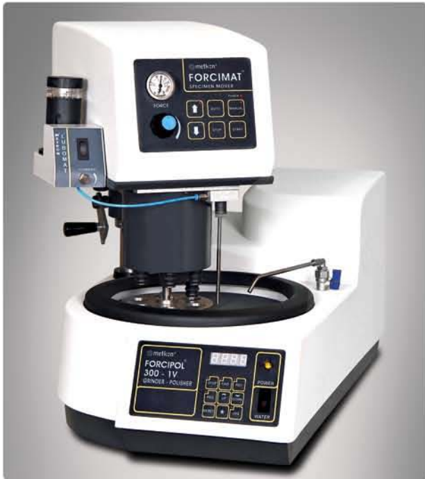
FORCIPOL 1V, Variable speed grinder / polisher with FORCIMAT Automatic Head.

Forcipol 1V For laboratories preparing a wide range of different materials, Forcipol 1V is the ideal grinder/polisher with its indefinitely variable speed range between 50-600 rpm.